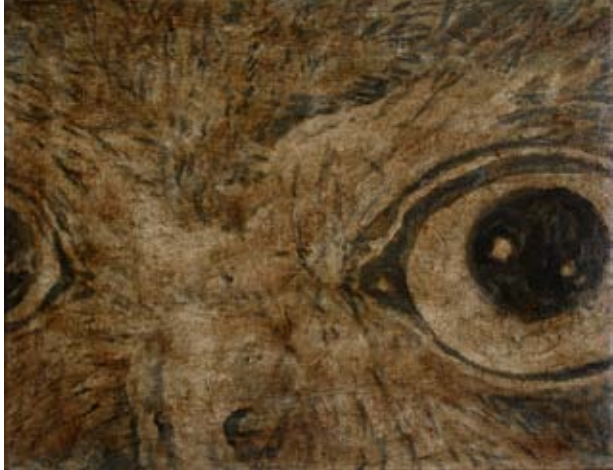
Boobook Owl oil on canvas 33 x 41 cm $850

The small series of fauna and flora images are of the south west region. Mostly hidden in the paint film, they flash into view at various viewing angles and light situations. They are a gesture of the storehouse of specialised rarity that may once again flourish amongst the new green corridors of a healed land.