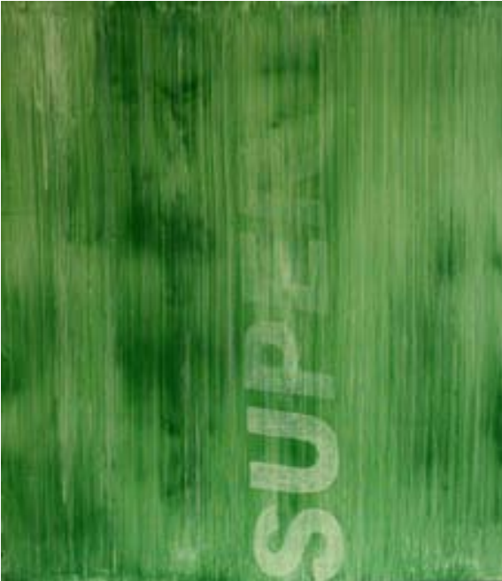
Super oil on board 113 x 95 cm $2,500