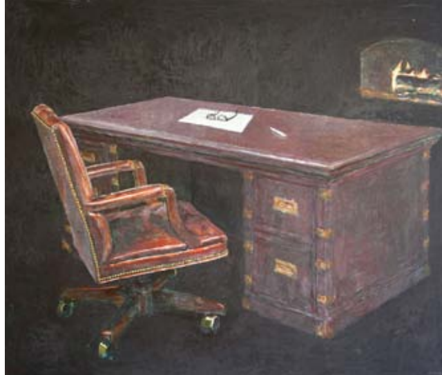
Lacquered Wood Shiny Pen oil on canvas 120 x 140 cm $4,000