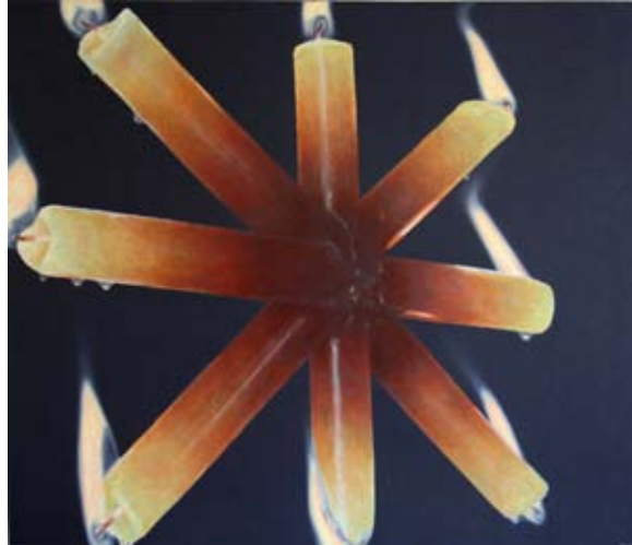
Busy Monster oil on canvas 120 x 140 cm $4,000

The small series of fauna and flora images are of the south west region. Mostly hidden in the paint film, they flash into view at various viewing angles and light situations. They are a gesture of the storehouse of specialised rarity that may once again flourish amongst the new green corridors of a healed land.