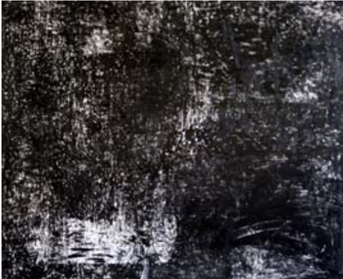
Great Southern oil on canvas 140 x 170 cm $5,800