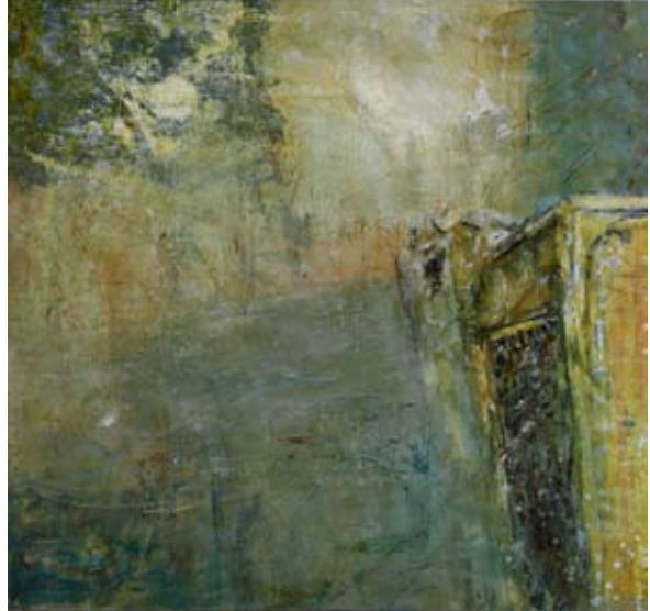
Diesel and Dust oil on board 55 x 58 cm $1,200